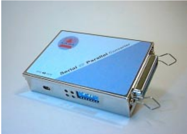
Switch selectable to provide either Serial to Parallel or Parallel to Serial interface conversion.