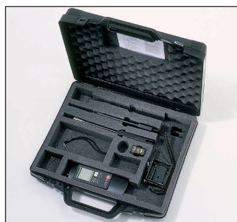
Transport case (plastic) for instrument and accessories For safe and orderly storage Part no. 0516 0184