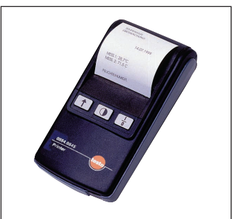
Testo printer with 1 roll of thermal paper and 4 AA size batteries For testo 935 Part no. 0554 0545