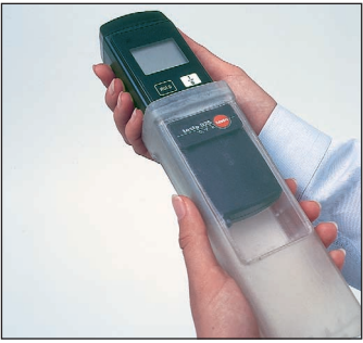
TopSafe (indestructible protection case) with bench stand Part no./See Accessories Ordering data