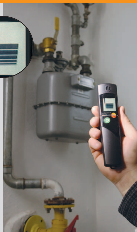
Audible warning about dangerous gas concentrations e.g. at gas pipe connections