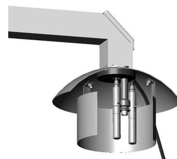
For calibration, a portable HMP77 reference probe is easy to attach beside the HMT337 or PTU307 probe.

Obtaining a true humidity reading is particularly important e.g. in traffic safety: at airports and at sea as well as on the roads. It is essential, for example, in fog and frost prediction.