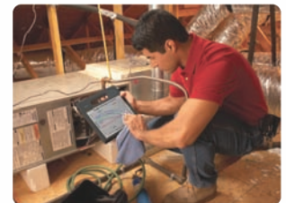
Easily clean the rugged F5v while working in harsh environments.

The Motion F5v comes standard with Gorilla™ glass , offering up to four times the strength in breakage resistance 3 , perfect for real-world mobile work environments. Add 180-degree viewing angles , Hydis AFS+ LED backlit display and View Anywhere® technology for reduced reflectance and glare and you get the best tablet PC viewing experience available for outdoor use. Improved battery life over typical displays and an extremely damage-resistant surface make the Motion F5v tough enough to withstand your work environment and powerful enough to get the job done.