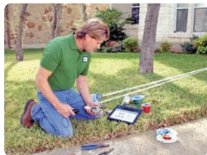
Take the F5v with you no matter where your work takes you.

Don't worry. The F5v brought its hard hat. Tested and proven to withstand field-ready conditions such as dust, heat and rain, the Motion F5v is ready to work wherever you're working. The strong internal magnesium frame, shock mounted display and hard disk drive (HDD) or optional solid state drive (SSD) protect against drops and bumps. Fully-sealed, the F5v is protected against the elements and easily cleaned.