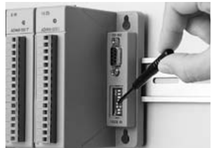
Node ID Setting