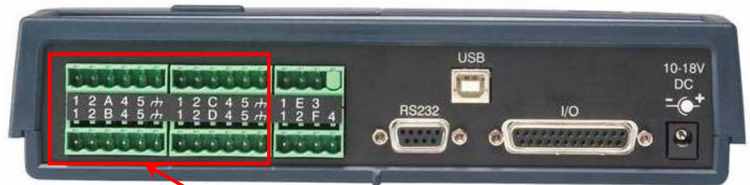
Input blocks A, B, C and D