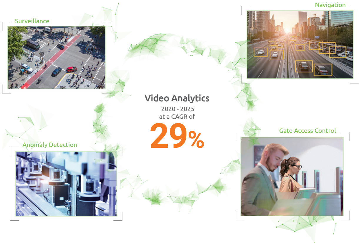
Figure 1. Industries are employing video analytics to extract actionable information.

As a result, EVA minimizes latency and does not need a persistent network connection, making it suitable for both mobile and stationary deployments. EVA also alleviates privacy and security concerns over confidential data.