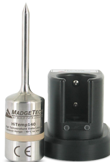
IFC400 (sold separately)

The HiTemp140 can store up to 32,700 readings, and features a rigid external probe capable of measuring extended temperatures, up to 260^{\circ}\text{C} ( 500^{\circ}\text{F} ). Custom probe lengths are available up to 7 inches. The device records date and time stamped readings, and has non-volatile solid state memory.