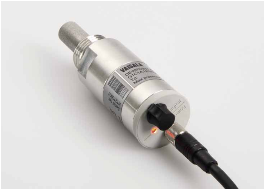
The Vaisala DRYCAP® Dewpoint Transmitter DMT143 is an ideal choice for small compressed air dryers, plastic dryers and other OEM applications.