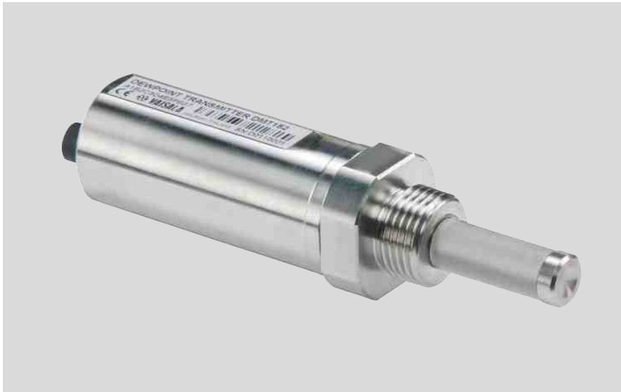
The small and powerful DMT152 measures dew point down to -80 °C.