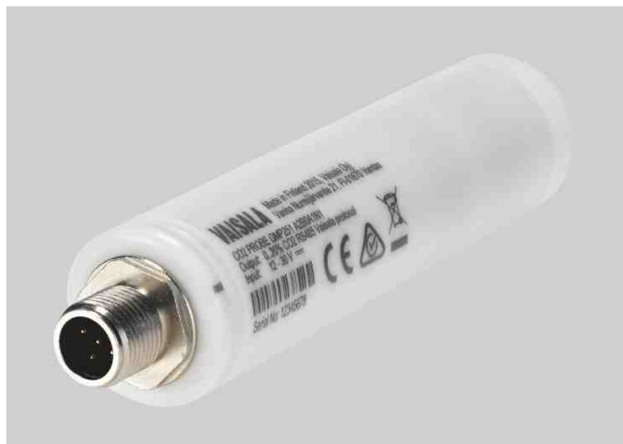
The GMP251 is shown in the actual size in the above image.

The Vaisala CARBOCAP® Carbon Dioxide Probe GMP251 is a new intelligent probe for measuring carbon dioxide. This robust, stand-alone measurement device is designed for use in demanding applications, like life science incubators, where stable, reliable, and accurate performance is required. The GMP251 is based on Vaisala's unique, second-generation CARBOCAP® technology that enables exceptional stability. A new type of infrared (IR) light source is used instead of the traditional incandescent light bulb, which extends the lifetime of the GMP251. The GMP251 incorporates an internal temperature sensor for compensation of the CO 2 measurement according