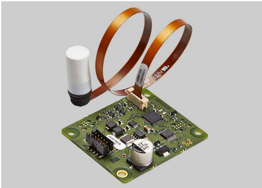
The Vaisala HUMICAP® Digital Humidity Module HMM105.