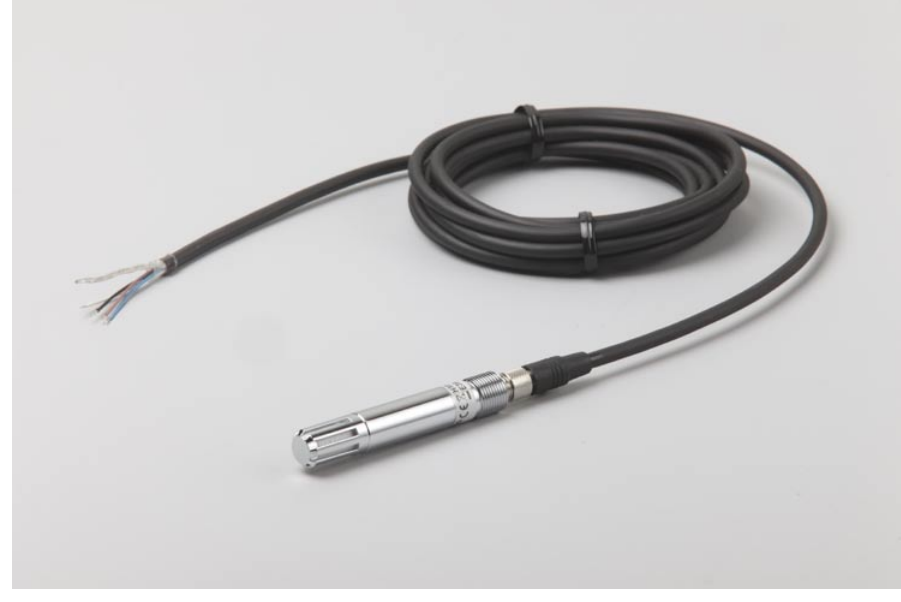
The HMP110 with excellent stability and high chemical tolerance.