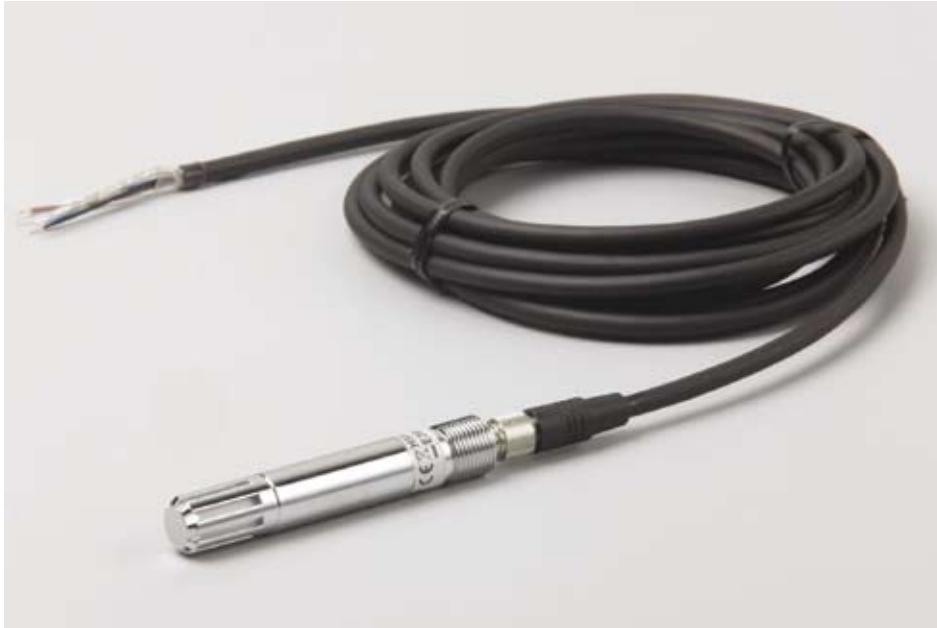
The HMP60 for extreme conditions.