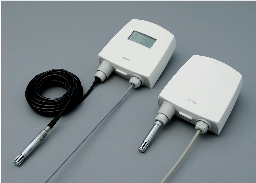
The HMT120/130 with and without a display.

The Vaisala HUMICAP® Humidity and Temperature Transmitters HMT120 and HMT130 are designed for humidity and temperature monitoring in cleanrooms and are also suitable for demanding HVAC applications.