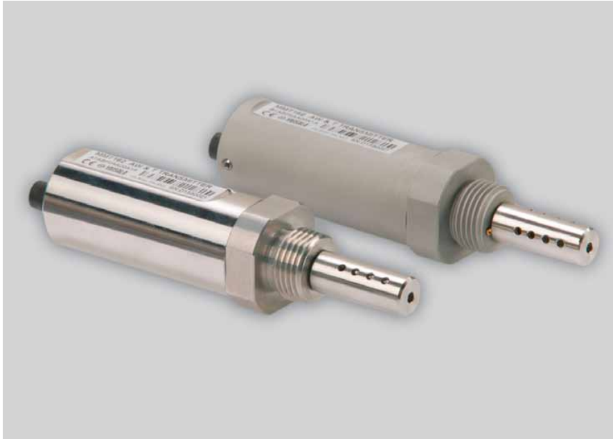
The MMT162 enables on-line moisture monitoring in oils even in the most demanding applications.