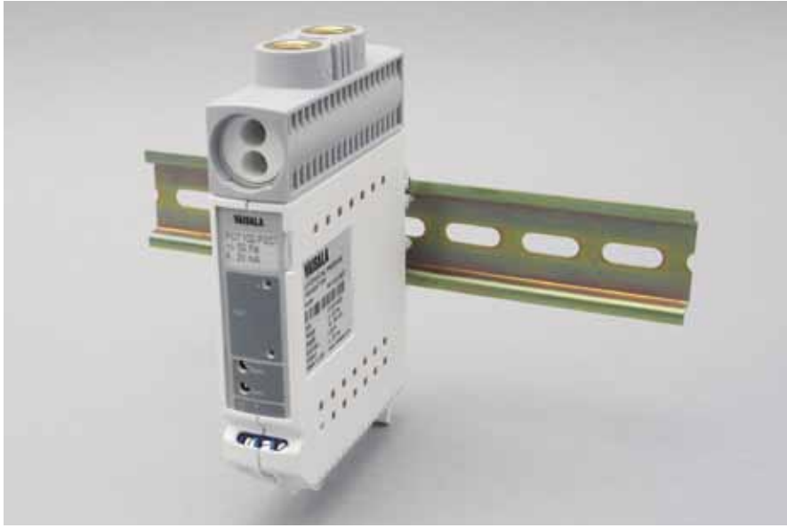
Vaisala Differential Pressure Transmitter PDT102 with process valve actuator and test jacks.