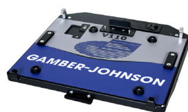
Gamber Johnson Vehicle Dock