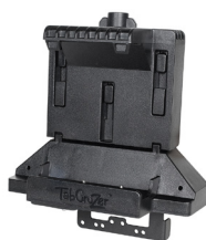
Gamber Johnson Vehicle Dock