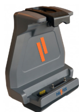
Havis Vehicle Docks