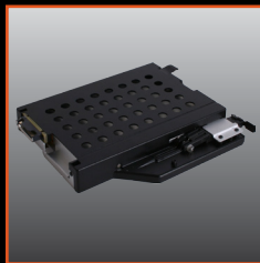
Multimedia Bay 2 nd HDD