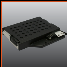
Multimedia Bay 2 nd Battery