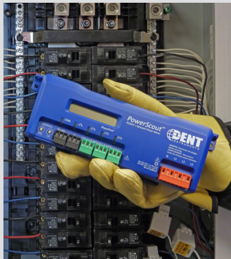
Use the standard USB connection to easily power and configure the PowerScout 3037 at your office or in the field. Once connected to the panel, USB can also be used to verify setup and check real-time values.