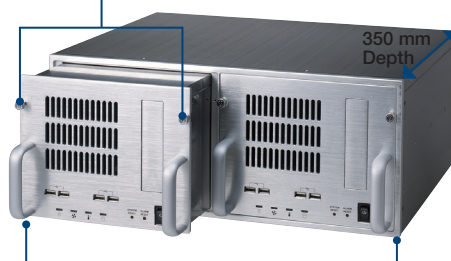
Dual Nodes Design

Thumb Screws to Fix The Sub-System in the Cage