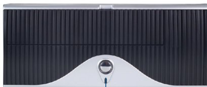
Power button with LED