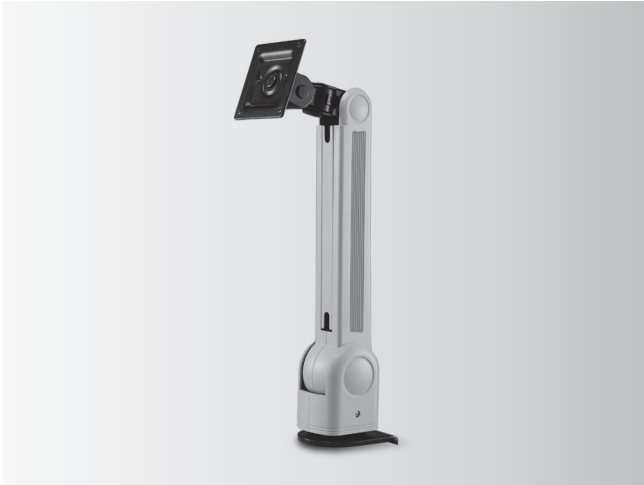
Table Arm For All PPC Models