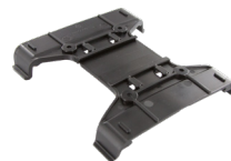
1 x DIN rail mounting bracket