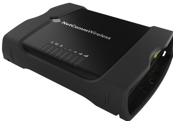
1 x NetComm Wireless (NTC-220)