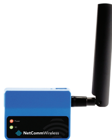
1 x NetComm Wireless NTC-3000 3G Serial Modem