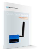
1 x Quick start guide