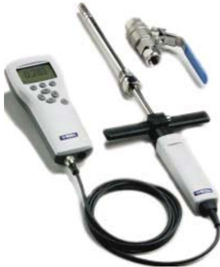
Vaisala HUMICAP® Hand-held Moisture Meter MM70