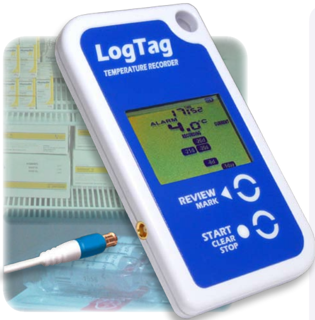
Part codes TRED30-7R, TRED30-7F

The LogTag® TRED30-7 Temperature Recorder measures and stores up to 7770 temperature readings over -40°C to +99°C (-40°F to +210°F) measurement range from a remote temperature probe.